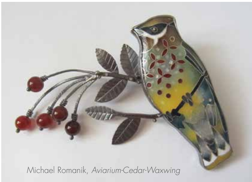
Aviarium-Cedar-Waxwing