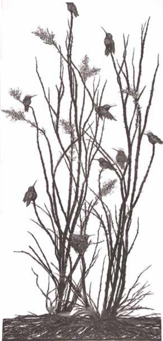
Lucrezia B. Bieler, Hummingbird