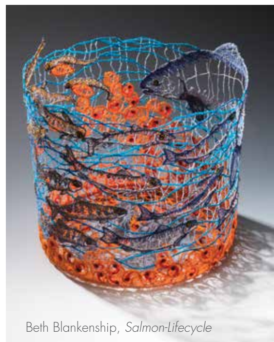
Beth Blankenship, Salmon-Lifecycle