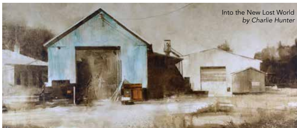
Into the New Lost World by Charlie Hunter

In past years, participating artists have produced over 250 to 300 pieces of fresh work. The exhibit commences with a Collector's Soirée and Artist's Reception on Saturday, May 13, in the Davenport and Vidinghoff Galleries from 6-10pm. Doors open precisely at 6pm for those with early patron viewing tickets and 7pm for regular admission tickets. The event offers a chance to meet the artists in a festive and elegant setting with open bar and heavy hors d'oeuvres. Martinis will flow from a hand-sculpted ice luge, Little Black Dress wines will be poured, and live jazz by