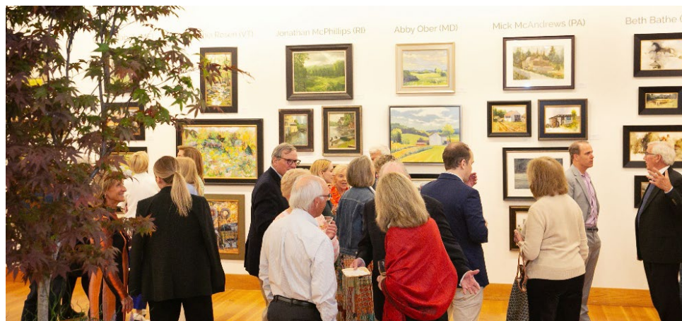
2024 Collectors’ Preview & Sale