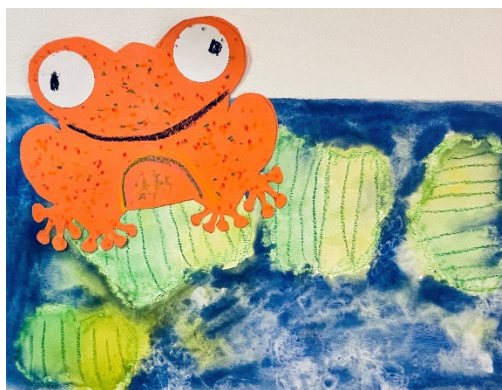
Artwork by Timothy School Student

The final exhibition is From Ordinary to Extraordinary which highlights artwork projects by the Timothy School students. Wayne Art Center is proud to collaborate with the Timothy School to provide studio art classes tailored to students who have autism and pervasive developmental disorder.