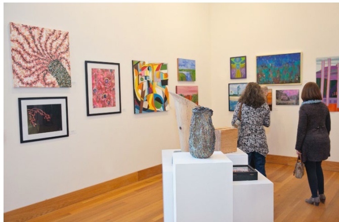
Expressions of Radnor, 2023