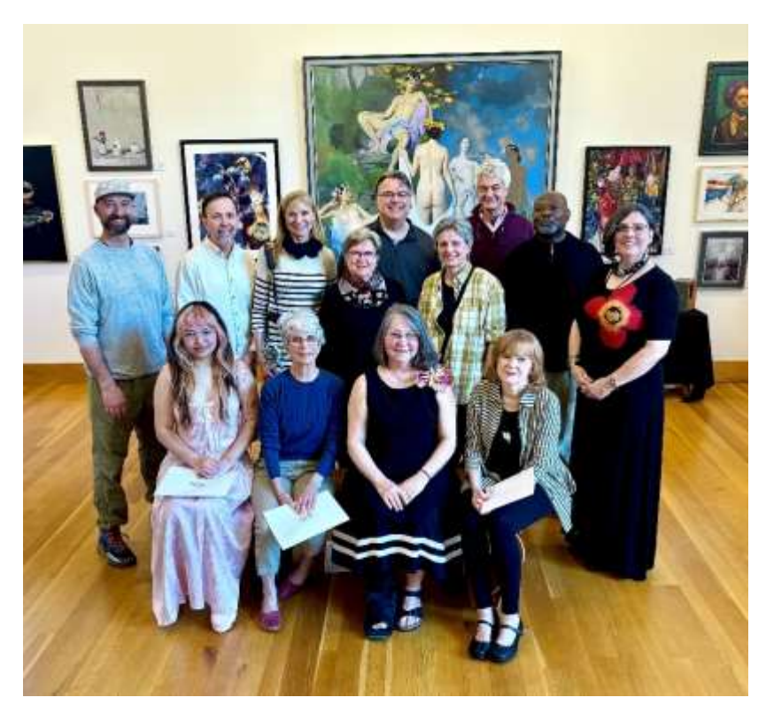
Award recipients photographed following the awards presentation at Wayne Art Center on March 30.