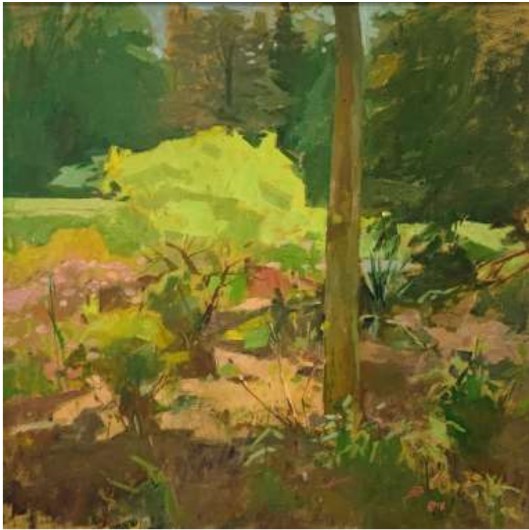
1st Place Stoneleigh by Edmond Praybe (Oil)