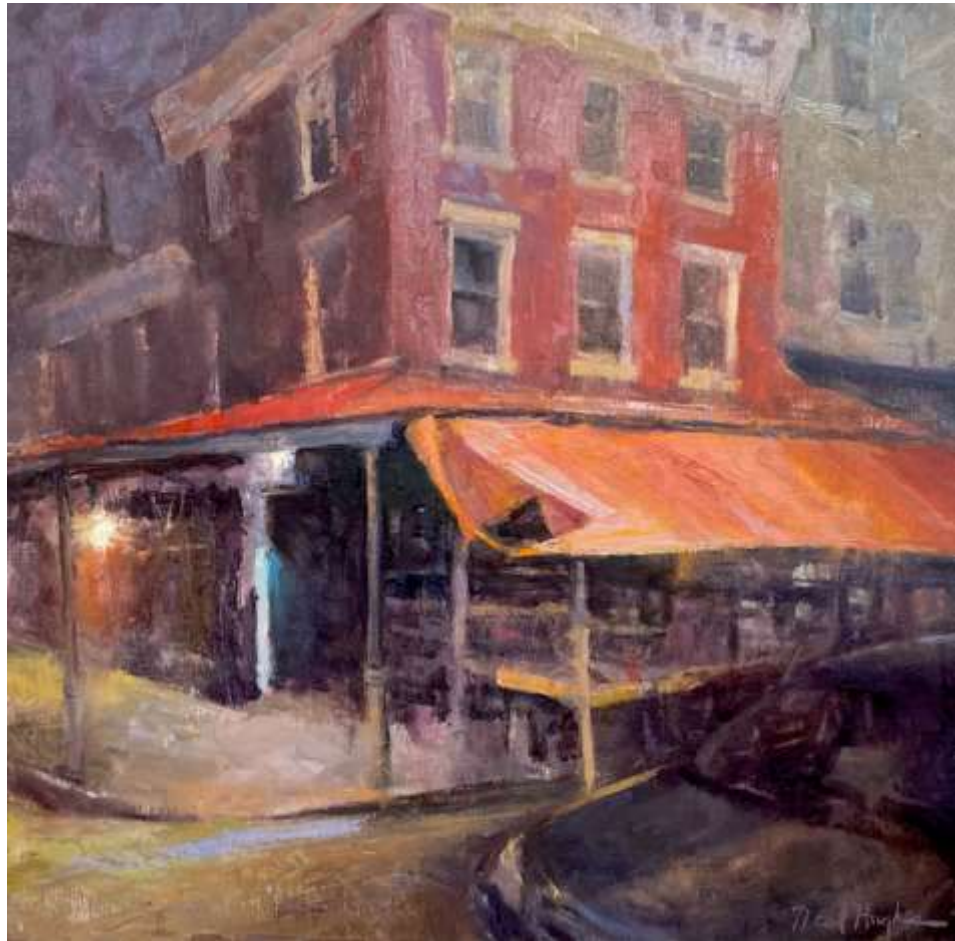
Best in Show Phillips on 9th Street by Neal Hughes (Oil)