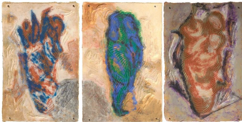
Lynn Sures, Printed Through Time and Space