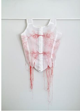
Rima Day, Concealed Desire II