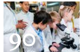
Selecting a School