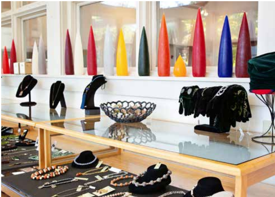
Wayne Art Center's Gallery Shop is one of this writer's pet places to find perfect gifts. She impatiently awaits the Holiday Shopping Weekend. Three days of amazing shopping opportunities from December 13th through 15th can't come soon enough. A gathering of 30 of some of the finest craft vendors in the area will show and sell incomparable treasures.

13 th through 15 th can't come soon enough. A gathering of 30 of some of the finest craft vendors in the area will show and sell incomparable treasures.