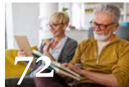
Senior Living Communities:

Academies of Incredible Accumulated Knowledge