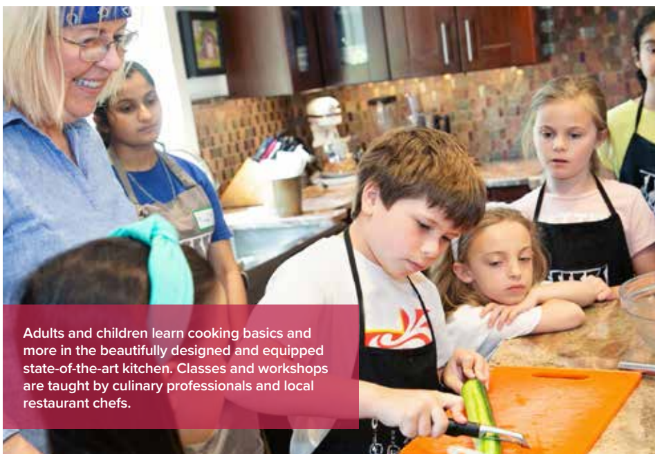
Adults and children learn cooking basics and more in the beautifully designed and equipped state-of-the-art kitchen. Classes and workshops are taught by culinary professionals and local restaurant chefs.

November 16 th , Margaret will be back with Botanical Art in Graphite & Watercolor. Drawing ideas from fall flowers and foliage, students will learn to build a botanical artwork using graphite and watercolor on paper or calfskin vellum.