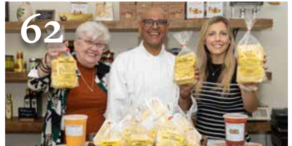
Pasta Heaven Passion Supernaturally Rooted in San Marco Pasta