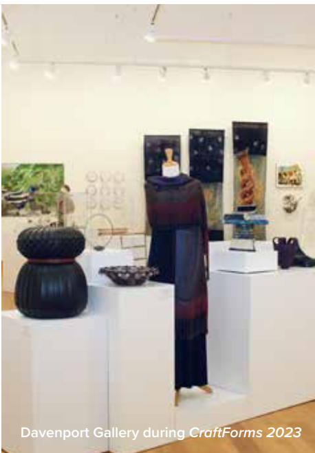
Davenport Gallery during CraftForms 2023

An array of painting classes offers appealing adventures in art.