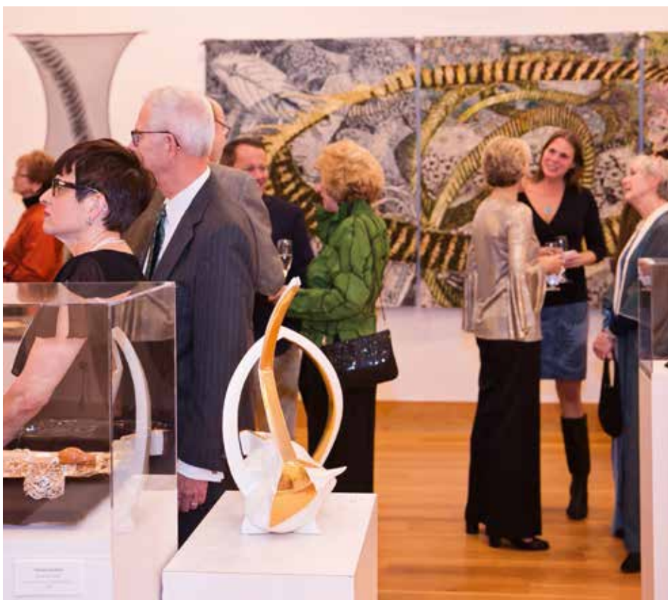
Wayne Art Center is renowned internationally for juried exhibitions.

Wayne Art Center's Gallery Shop is one of this writer's pet places to find perfect gifts. Three days of amazing shopping opportunities from December 13 th through 15 th can't come soon enough.